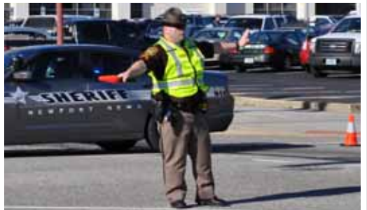
Top: NNSO K-9 Unit responds Middle: Deputies secure perimeter Bottom: Traffic control around secured perimeter